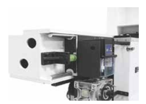
SERVO DRIVE SYSTEM

► For smooth movement of panel board. Steel balls on table prevent scratches on surface.